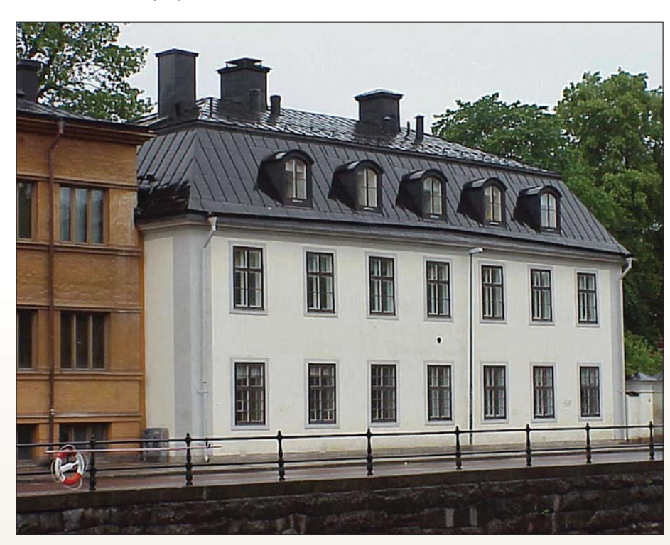
Figure 10. Laboratorium Chemicum of the University of Uppsala, which was built in 1753, served the chemistry department until 1858. Here Torbern Bergman and Anders Ekeberg worked; tantalum was discovered here in 1802. Now the building is used by the Department of Hydrology. (Västra Ågatan 24, N59° 51.33 E17° 38.43). The present Kemicum (Chemistry Building) is 750 meters to the west, up a steep hill.

Kimito Church." A Swedish mile is equivalent to 10.7 km, placing the site 8.0 km west of the famous Kimito Church, dating from the 1200s. The Finnish Geological Survey furnished the information that this exact site (once a tin mine, now a feldspar quarry) is known: N60° 8.59 E22° 35.98. "Skogsböle" is an archaic Swedish name for "forest home."