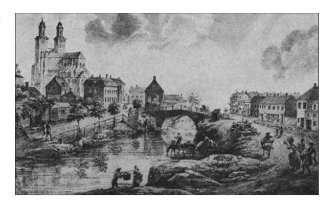
Figure 11. Appearance of Uppsala during the time of Ekeberg, looking westward on the Fyrisan River, with the science building on the left side of the bank (over the shoulder, out of view). The Uppsala Cathedral (spires to the left) dates to the late thirteenth century. Further left is the dome of the Gustavianum.

the discovery of yttrium in gadolinite (Y<sub>2</sub>FeBe<sub>2</sub>Si<sub>2</sub>O<sub>10</sub>), beryllium was unknown and Gadolin misidentified it as aluminum.<sup>21</sup>