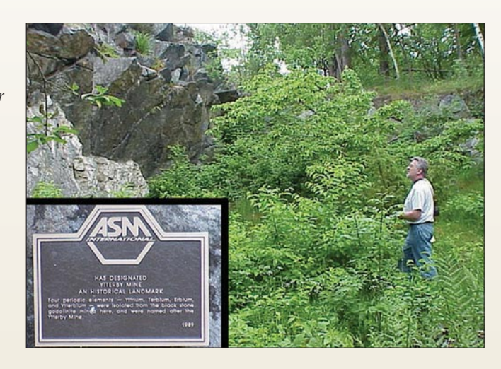
Figure 12. The Ytterby Mine (N59° 25.60 E18° 21.18) produced high quality quartz and feldspar for the porcelain trade in Britain and Poland. Today the mine is blocked and overgrown with vegetation. Ytterby means "outer village." Not only the first rare earths were discovered here, but also tantalum.

Next: Columbium (niobium) and tantalum are distinguished by Rose and Marignac, and the name niobium replaces columbium universally.