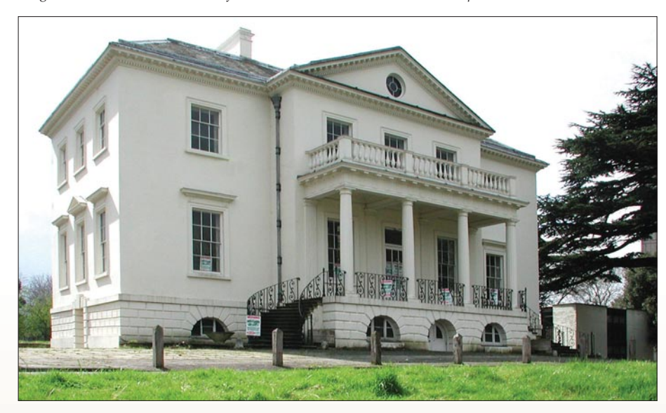
Figure 7. Mount Clare, Hatchett's home during his middle years. Berzelius visited Hatchett here in 1812 and described his estate as an Italian villa with a very well-equipped laboratory nearby— which unfortunately Hatchett did not much utilize. Mount Clare is now owned by the University of Roehampton and is being remodeled for offices.

National Register of Historic Places, N42° 3.54 W72° 7.76). As governor of Connecticut (1657–1676), John Winthrop II lived in New London. His columbite specimen originated in the Middletown-Haddam area. <sup>17a,b</sup> Original Native American names of communities, used in the 1600s, are in parentheses.